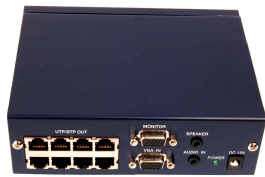
4/8-output Local Unit