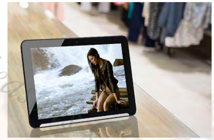
In-Store marketing in fashion store