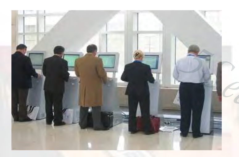
Exhibition Registration/ Internet kiosk