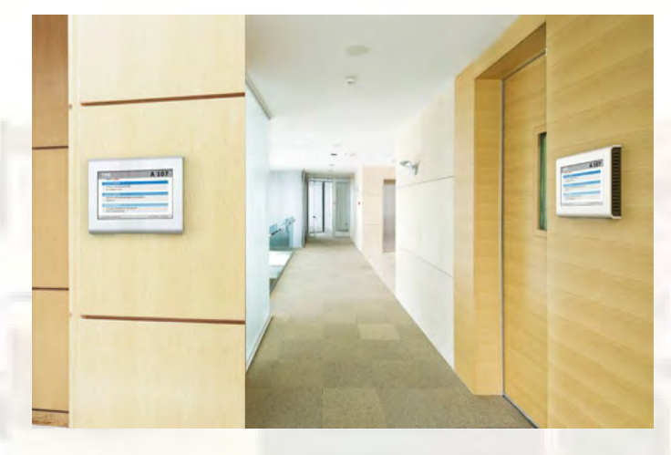
Digital Signage in Confroom