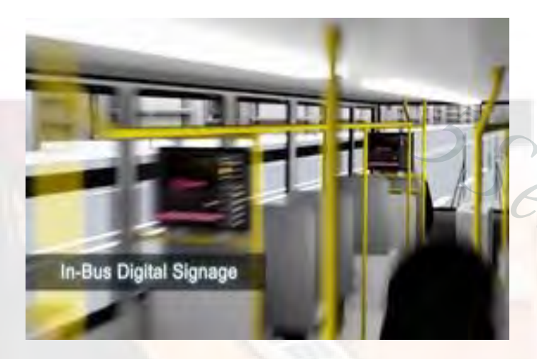
In bus/train Digital Signage