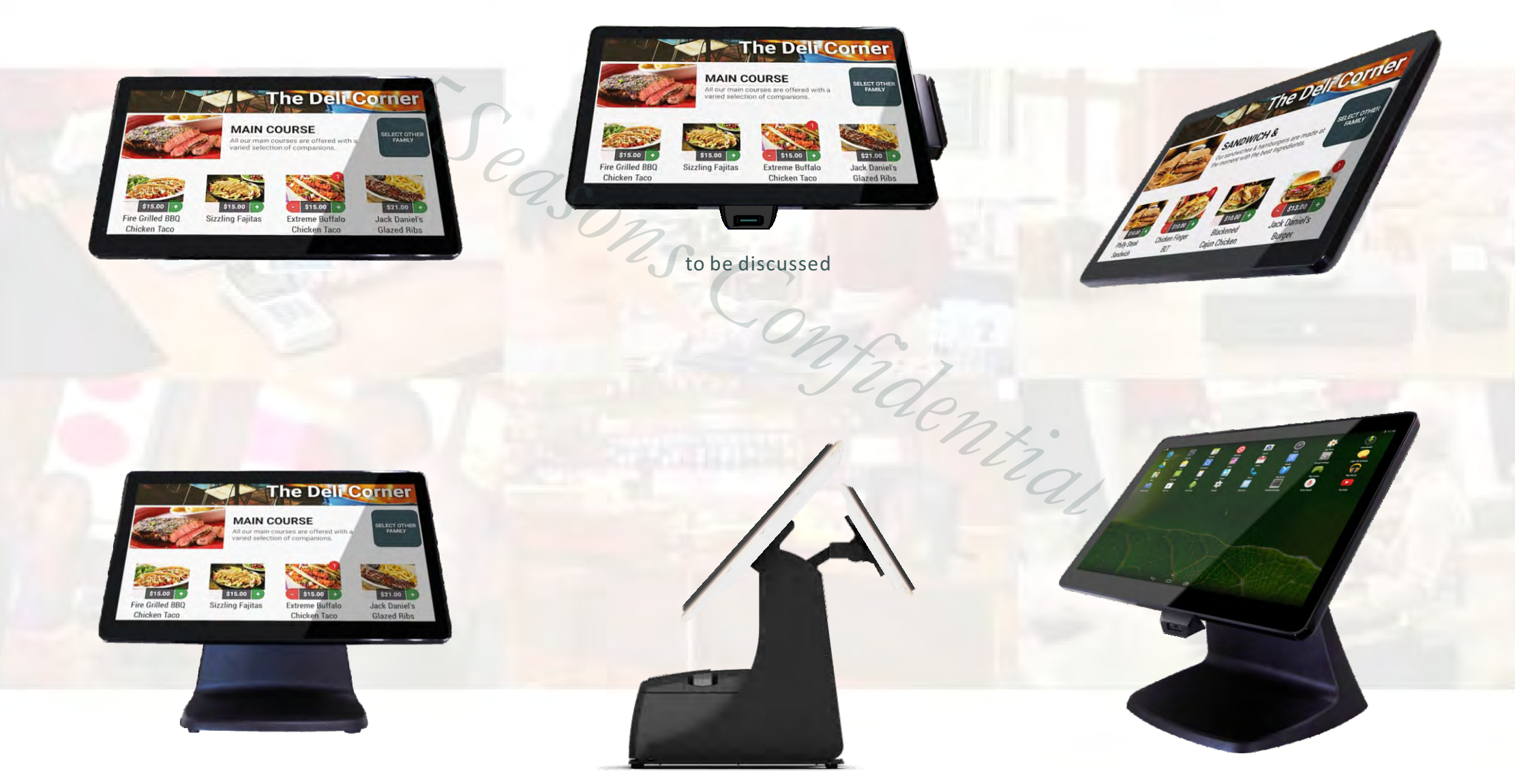
to be discussed to be discussed