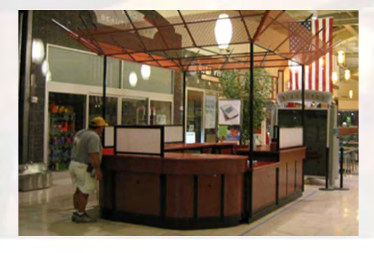
Electronic Kiosk in Information Station