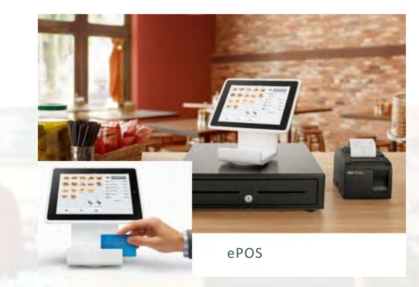
Preview menu in restaurant