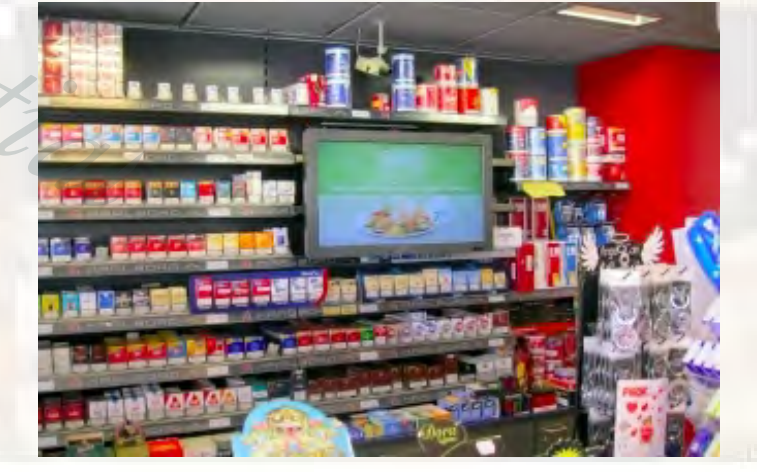
Retailed-Store Digital Signage