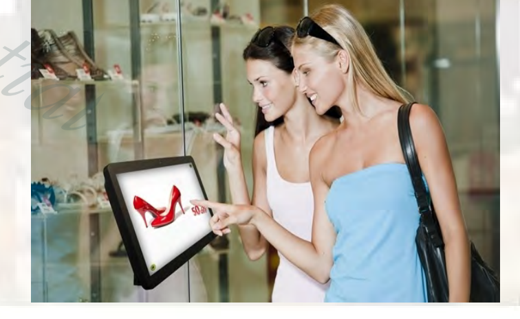
In-Store marketing at touch display