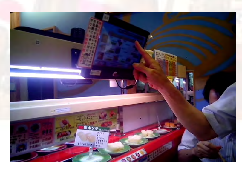
Self-ordering in restaurant