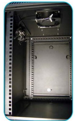
inside side view