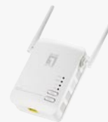
PLI-3410 200Mbps Powerline Adapter with Wireless Access Point